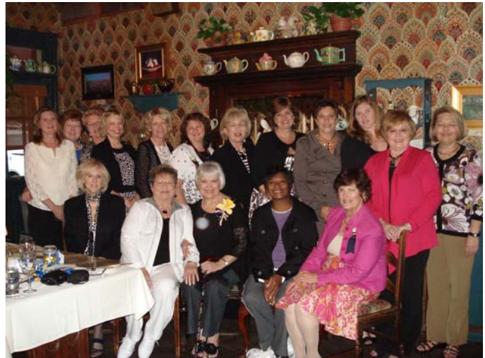
Ten Year Anniversary at Grand Finale's Tea Room